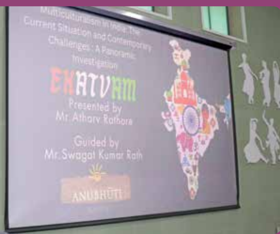
Indian Multiculturalism - Ekatvam