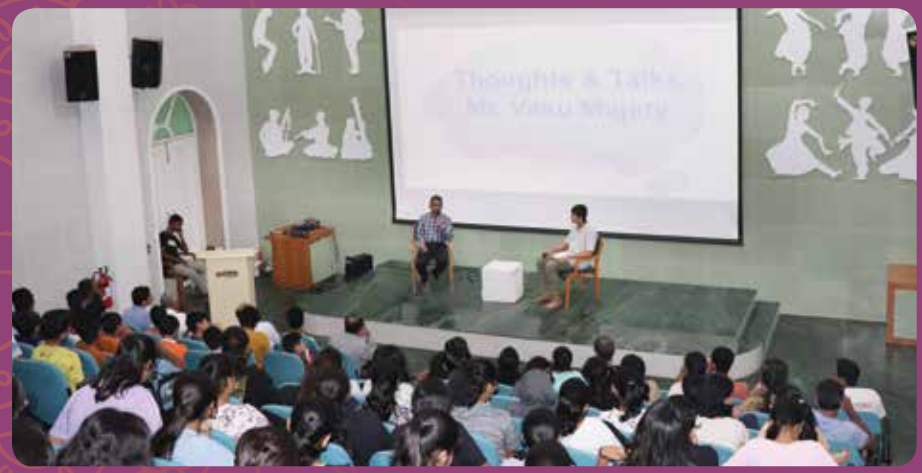
A Man with A Mission