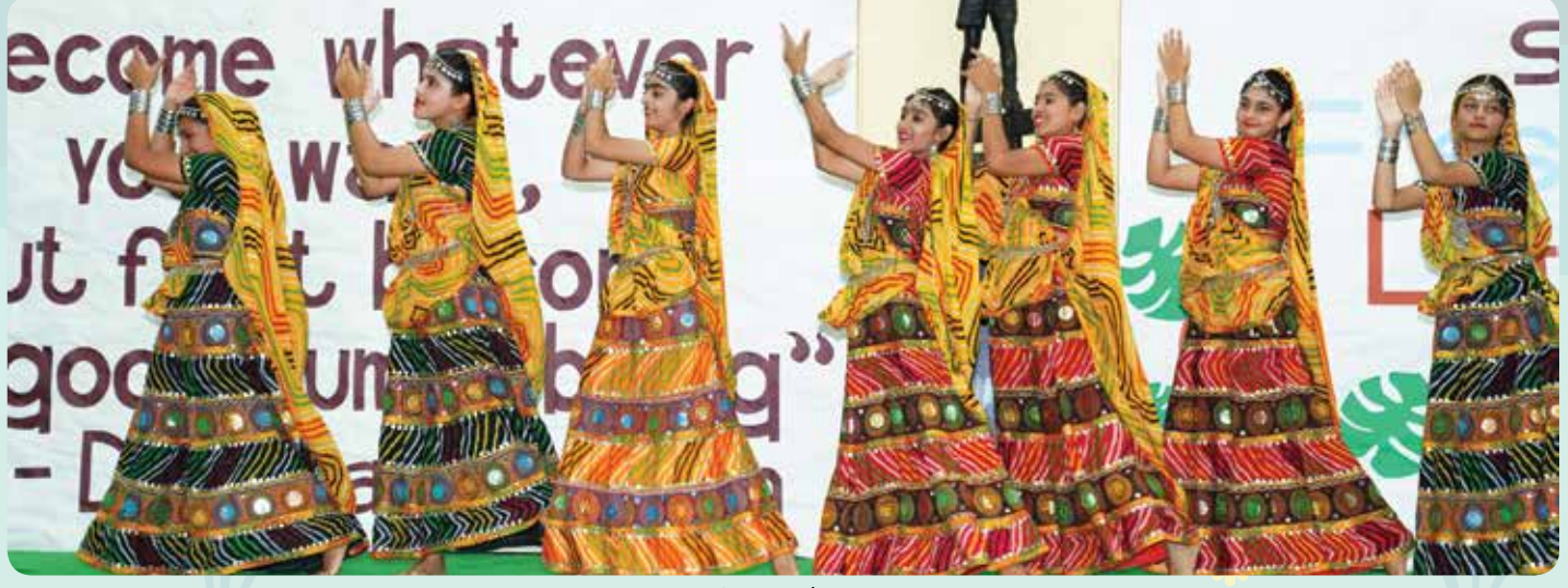
Dancing on the Beats