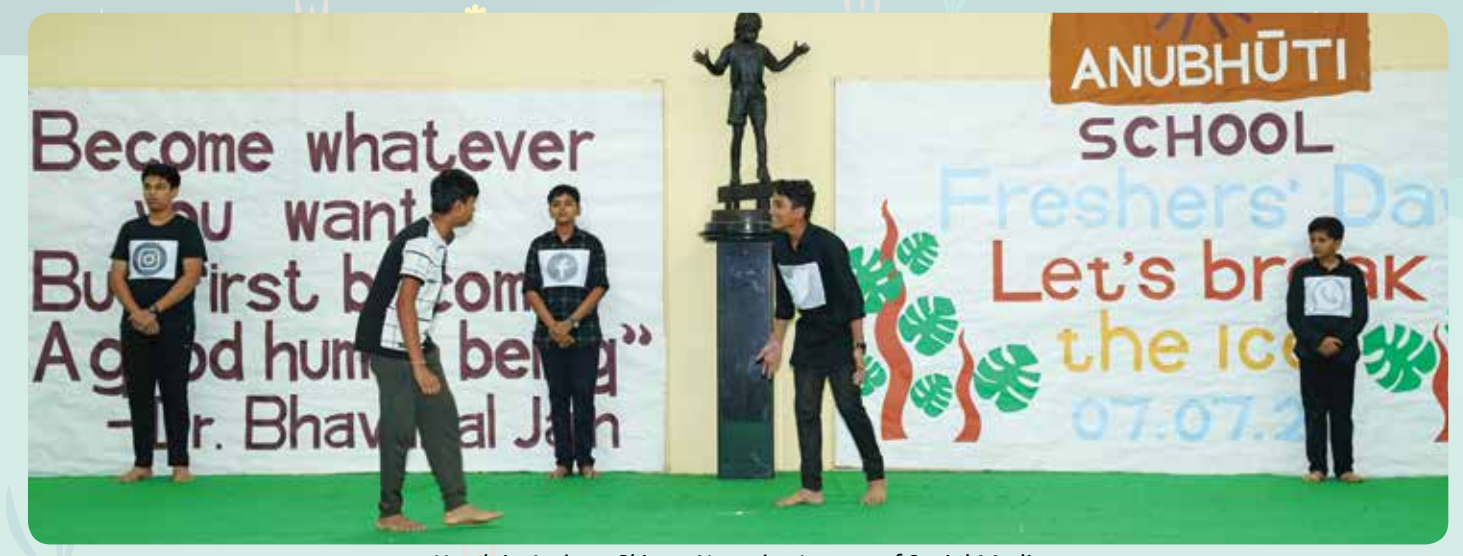
Youth in Action - Skit on Negative Impact of Social Media