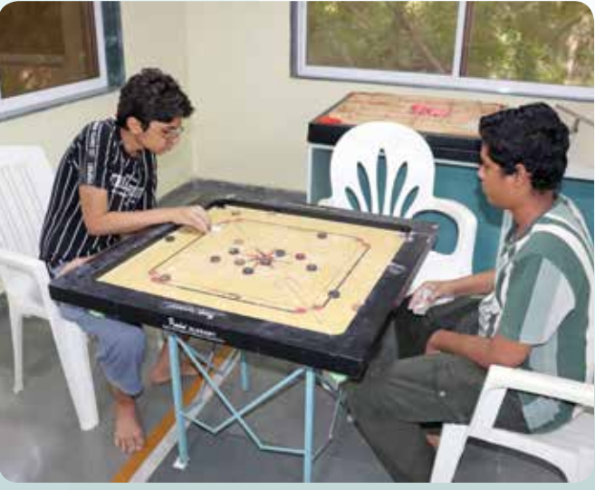
Aiming for the Perfect Shot