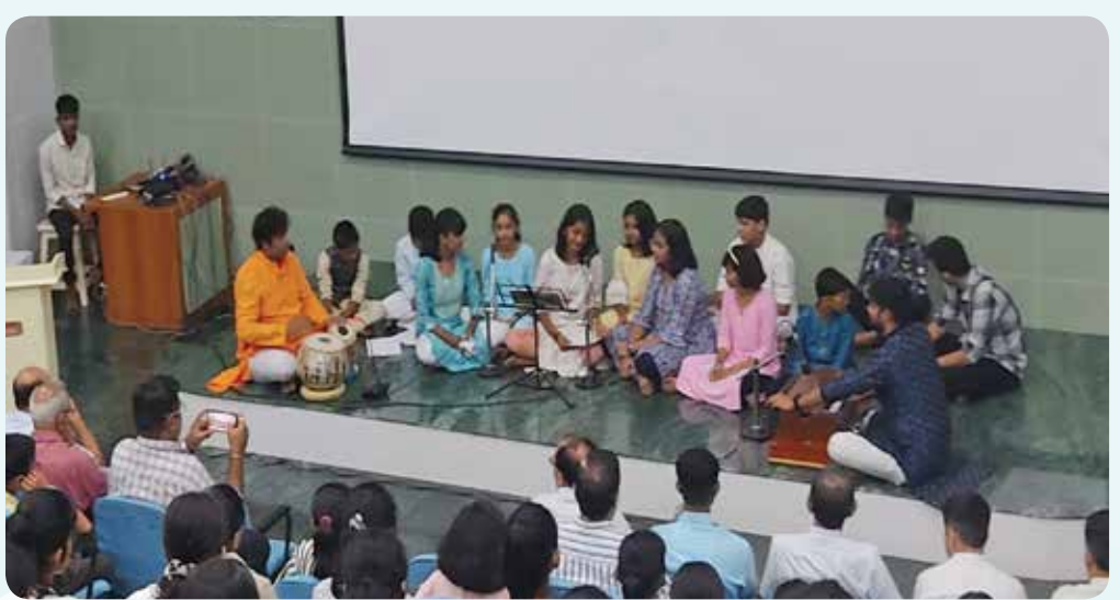
Choir Group - Chanting Mantras