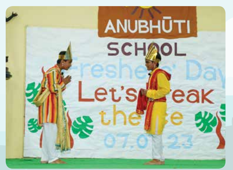
Drama - A Means to Communicate