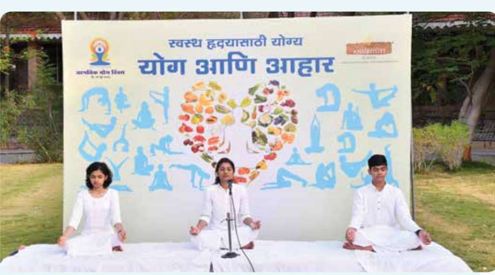
Yoga - The Way Of Life