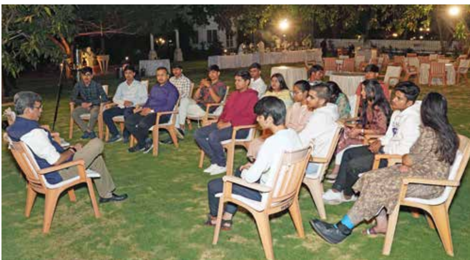
Class 10 and 12 at the Grand Dinner