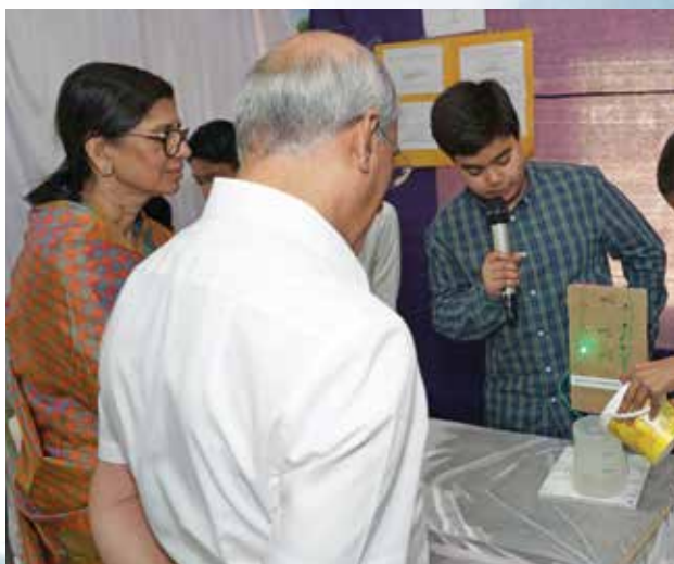
Innovation and Creativity: Science Day