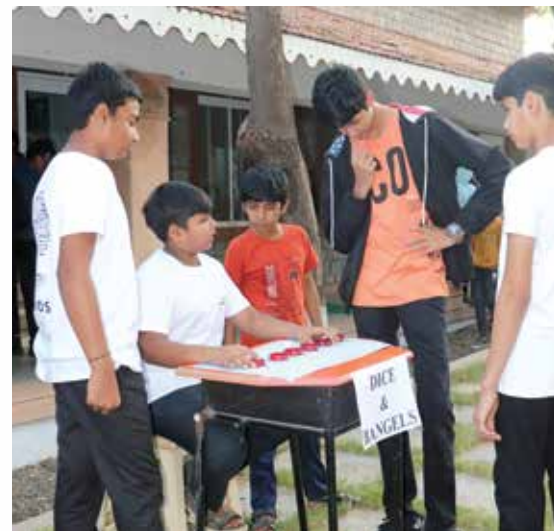
Test your luck: Commerce Week