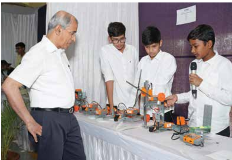
Advancing Technically: Robotics