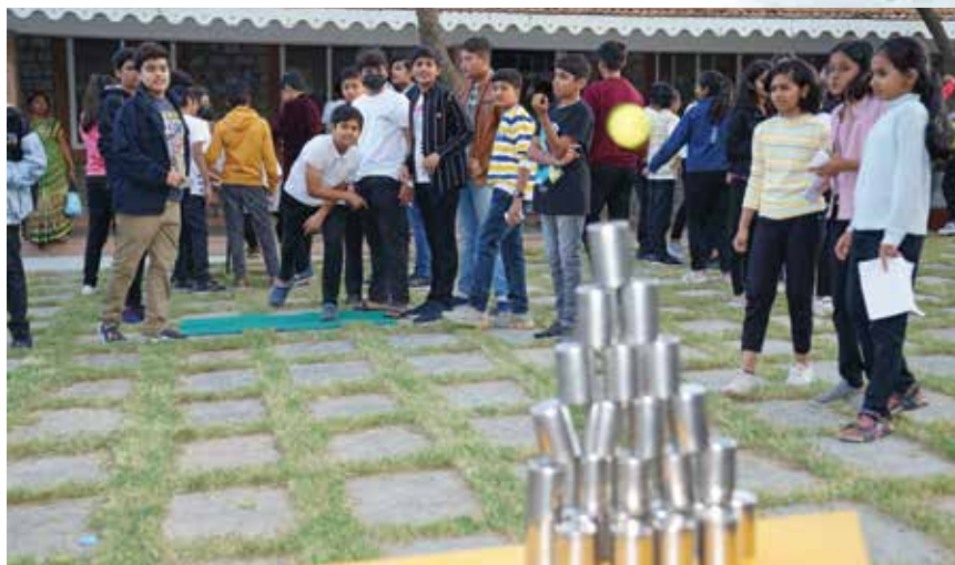
Fun Games: Commerce Week