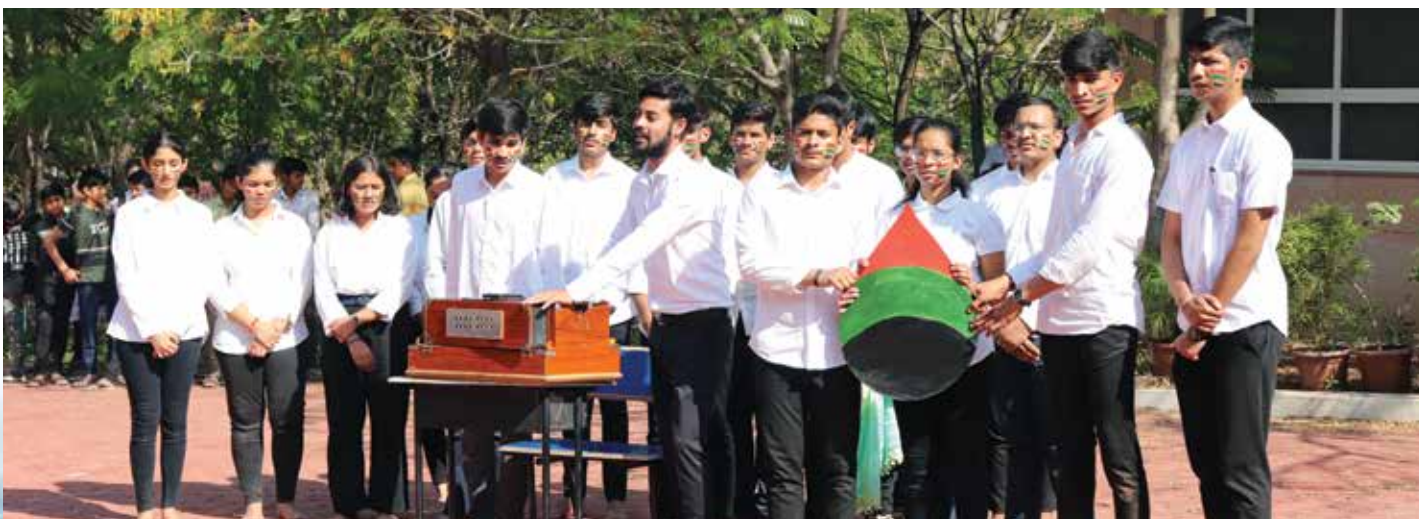
Pani Ke Rang