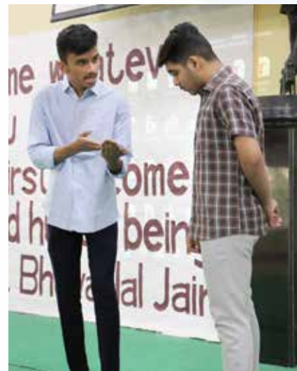
Life on stage