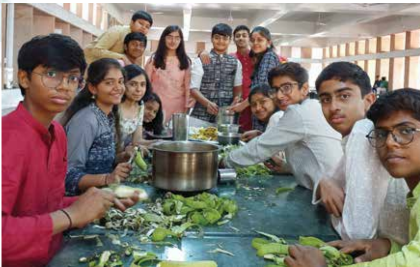
Too Many Cooks, Spice Up the Broth