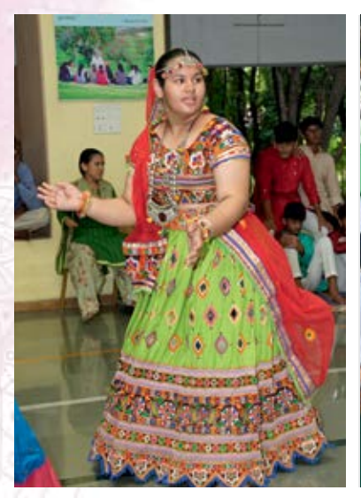
Garba: Dance of Life