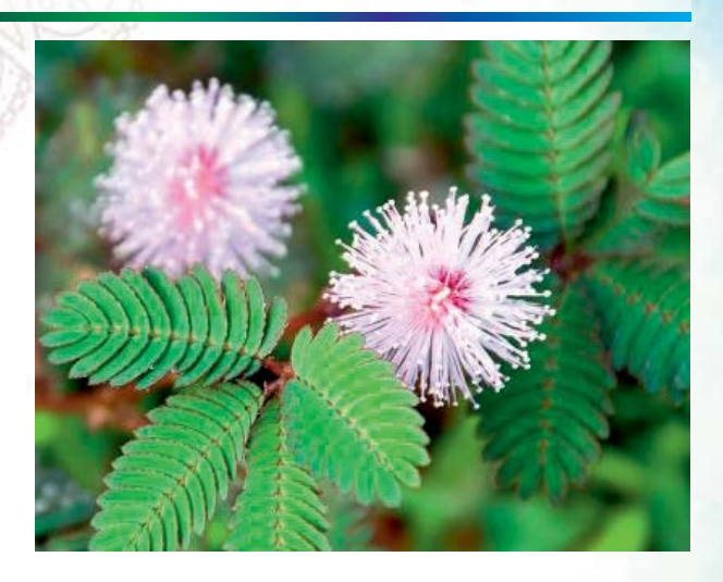
"sleep" or nyctinastic movement. The foliage closes during darkness and reopens in light.

This perennial flowering plant is often touched, blown or shaken on purpose to see its compound leaves rapidly fold inward and droop, defending themselves from harm, and re-opening a few minutes later. Like a number of other plant species, it undergoes changes in leaf orientation termed