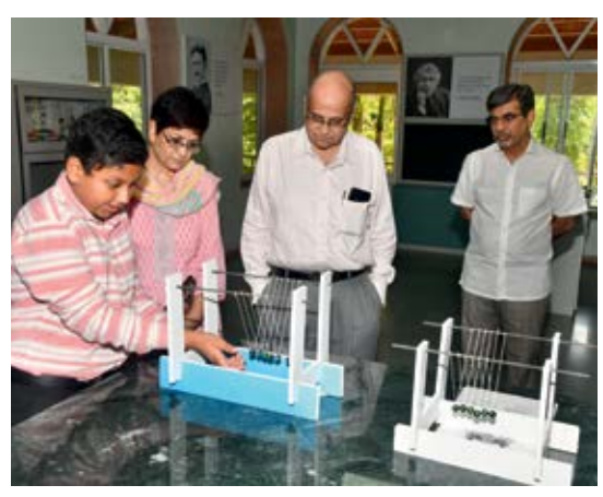
AIC: Do It Yourself