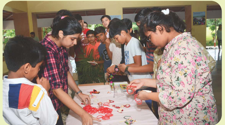
Friendship Day sale by TAXI