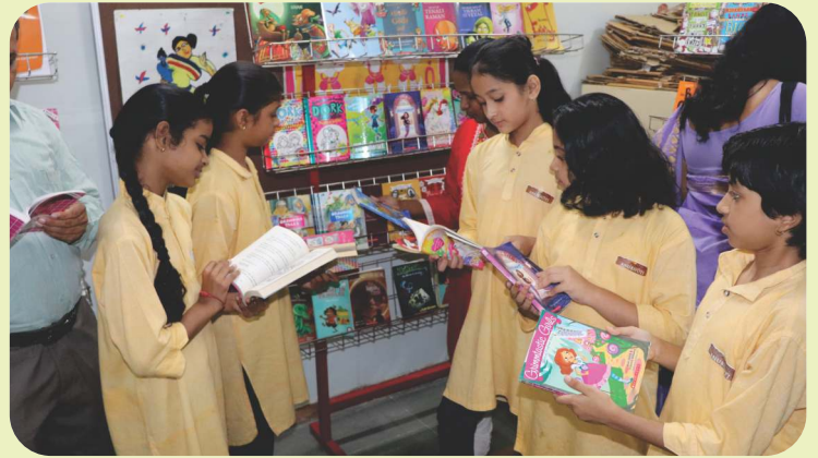
The Scholastic Book Fair