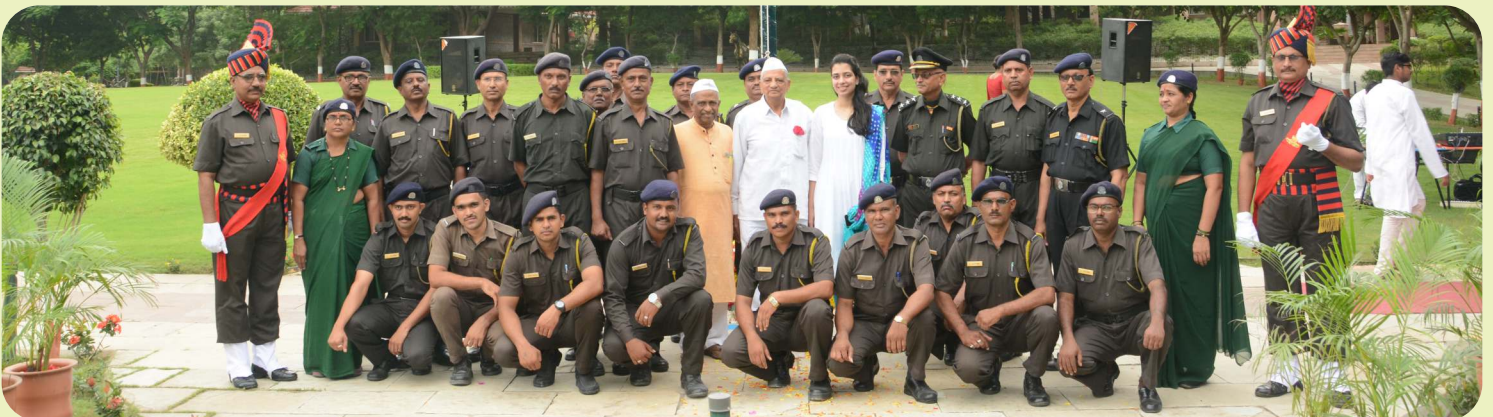
Security personnel @ Independence Day celebrations