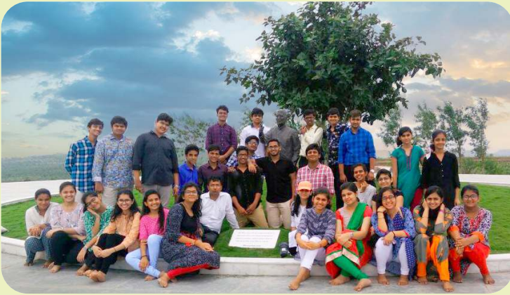
Grade XI @ Bhaunchi Shrushti