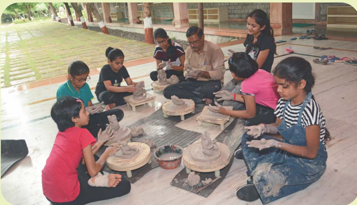
Ganesha modelling by students