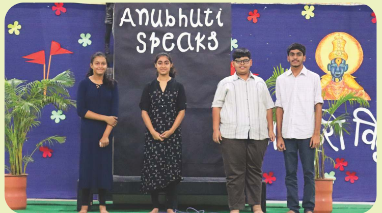
First session of Anubhuti Speaks