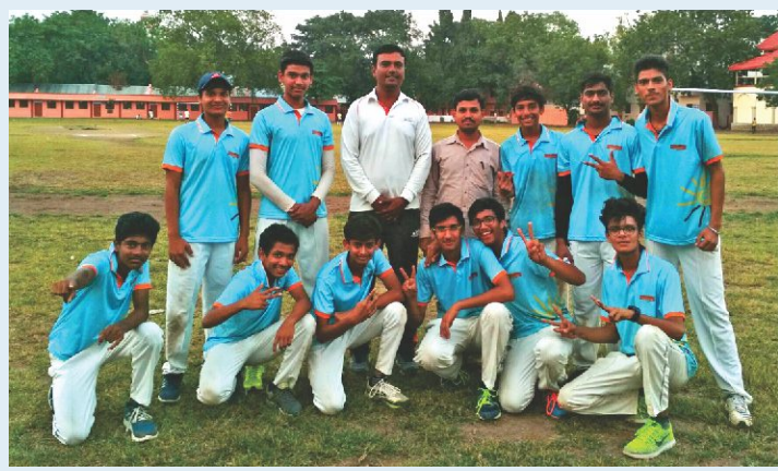
U-19 Cricket Champs