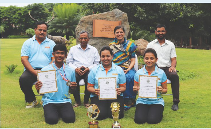
Proud champs of Anubhuti