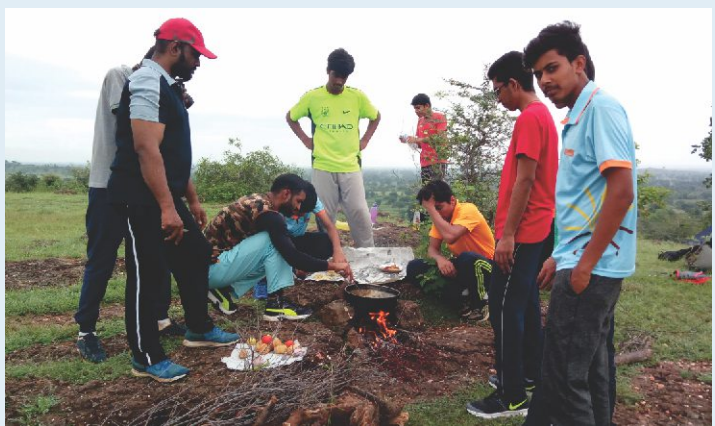
Chef at work on our trek!