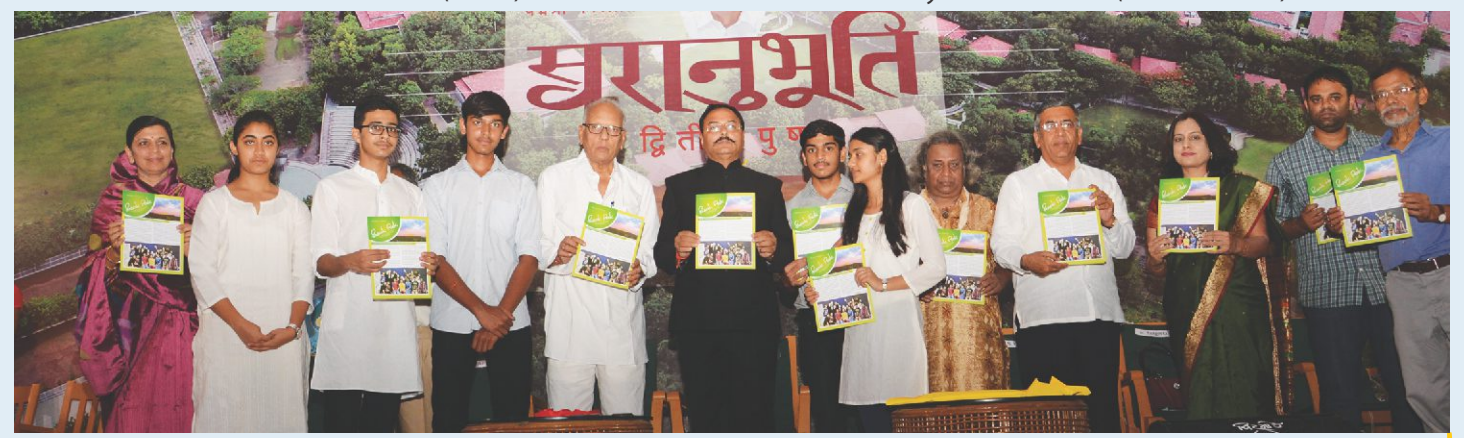
Releasing Sneak Peek, September Issue