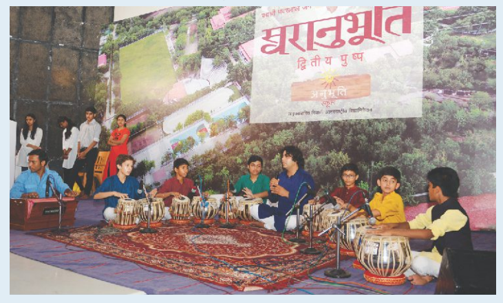
School's Tabla maestros