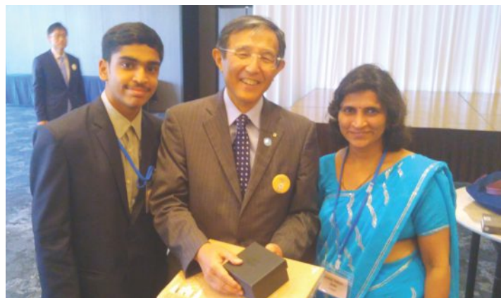
With the Governor of Wakayama