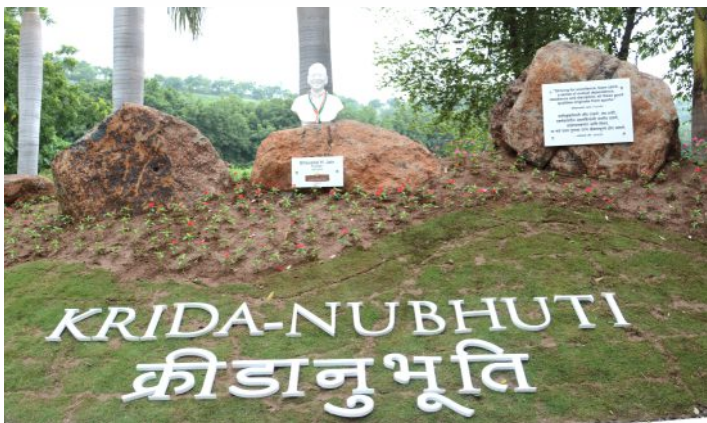
Dadaji's Statue Unveiled at Krida-Nubhuti