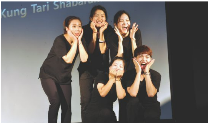
Korean Performing Arts group at Anubhuti