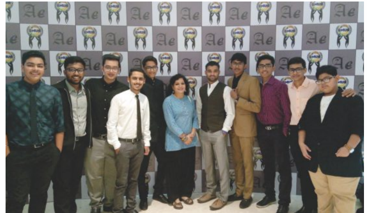
Anubhutians at IIMUN, Aamby Valley City