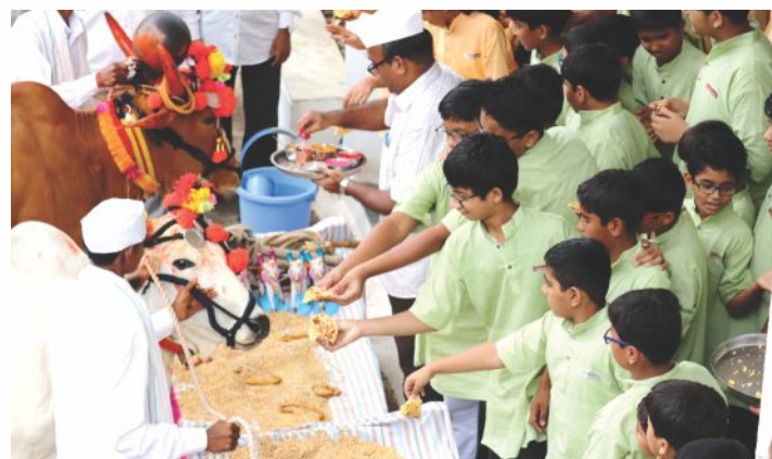
Pola Celebrations at Agri Park, Jain Hills