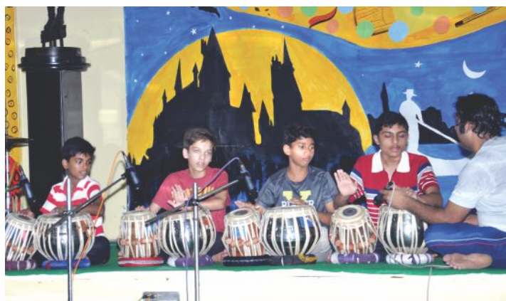
An Enchanting Musical Evening