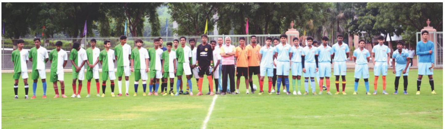
Football teams of Anubhuti & Jain Sports Academy