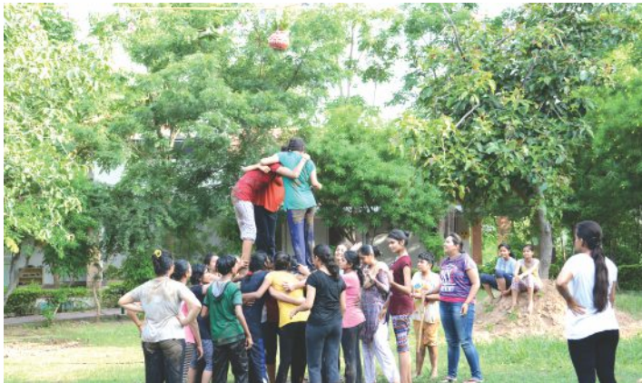
Girls group of Dahi Handi