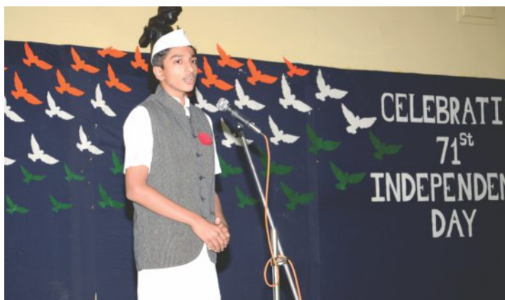
Independence Day Celebrations