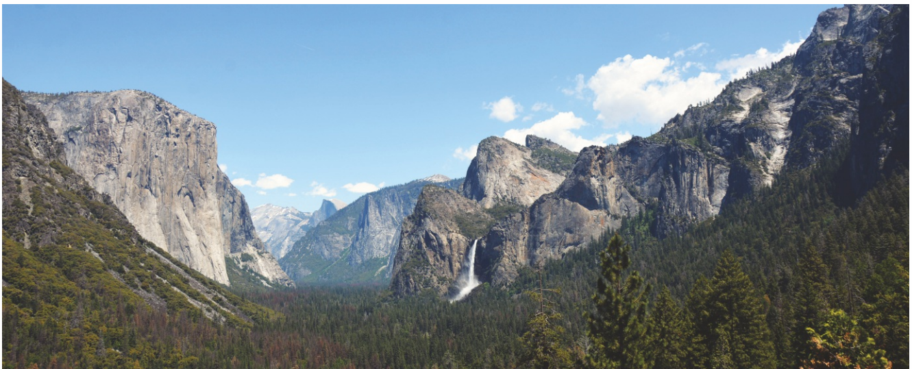
The Grand Canyon