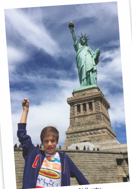
The Statue of Liberty

transport. The best place to visit in San Francisco is the Golden Gate Bridge. From San Francisco we took a flight to Orlando. Orlando was pretty much like Mumbai; it was very humid and it rained a lot. We went to the famous Disney World. It is spread over an area of 23000 acres. It boasts several themed parks, many resorts, water parks, etc. Out of the 5 parks we went to three of them and also to Animal Kingdom, Epcot Centre, and Magic Kingdom. Animal Kingdom was themed with all the animal characters, Epcot Centre had all the rides related to the future, and Magic Kingdom was based on the mythical characters. The next day we went to the Kennedy Space Center Visitor complex—the major field center of NASA. There we were going to watch a rocket launch but unfortunately we couldn't due to the rain. The next day we went to Universal Studios which is the best theme park I've ever been to. The whole park is themed with various scenes from the Harry Potter series. Anyone familiar with the Harry Potter world would love it. From Florida we flew northward to visit Niagara Falls and stayed there just for a day as we had to leave for New York City. On the first day in the city we went to the One World Trade Center—a beautiful memorial reminiscent of the original World Trade Centre. I spent the remaining days to explore the Times Square, the Empire State Building, the Statue of Liberty, and many more amazing places. On the 10th of June night we left for Mumbai and reached