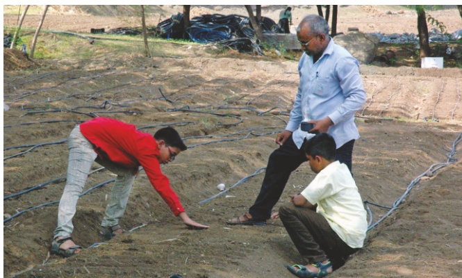
Tilling the Soil