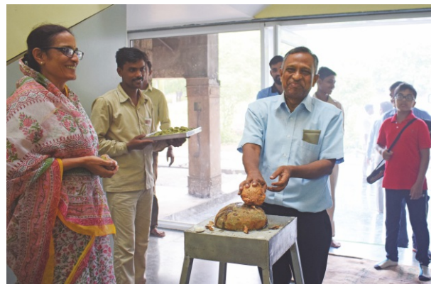
Inauguration of Badminton Hall