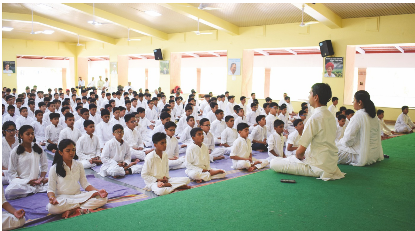
Practicing the Omkara chant