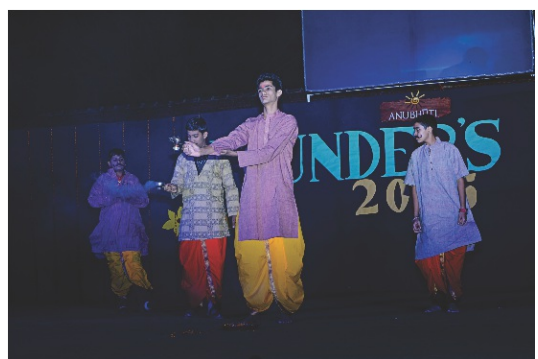
The religious fervour- the Great Ganga Aarti