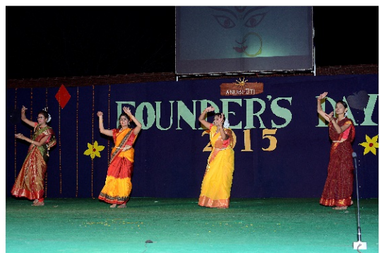
Life is a celebration