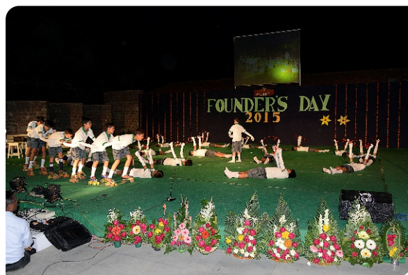
Sports at Anubhuti