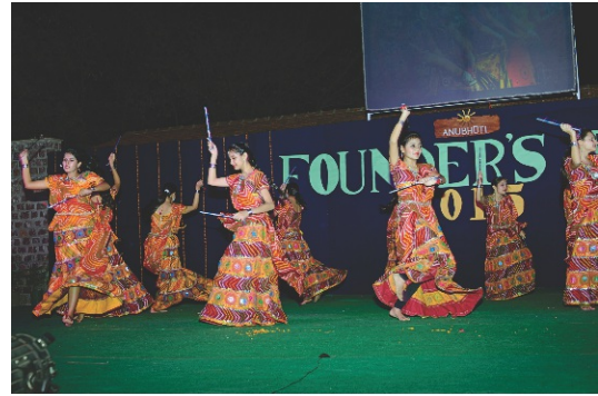
Ghoomar, a reflection of Rajasthan