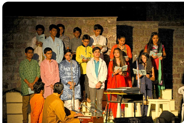
A prayer to Ma Saraswati