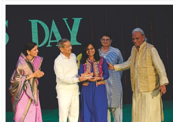
Toppers have their own unique personality

The theme, 'A Day at Anubhüti' was presented in the form of skits and musical performances. To give a feel of the Anubhüti world to our dear parents, our juniors gave a glimpse of what goes on the entire day at school. Beginning the day with prayer and yoga and ending it with a few scenes from the dorms at night was the theme on which the juniors performed.