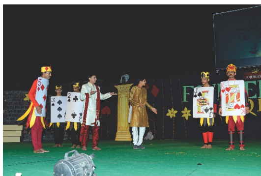
Skit on being happy-Kingdom of Hearts