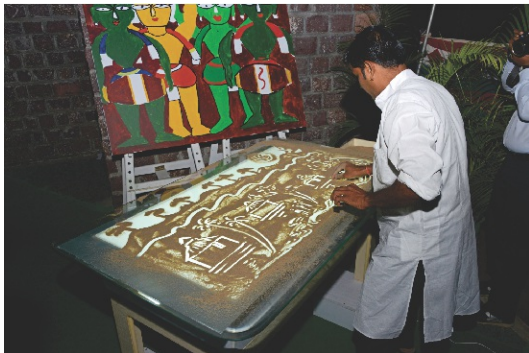
Stunning Sand Art by one of our Art Teachers