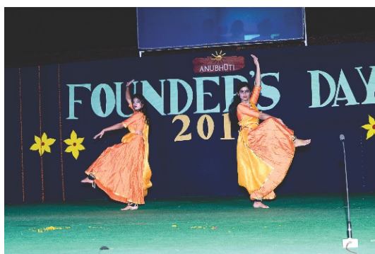
Shiv Tandav kept us enthralled