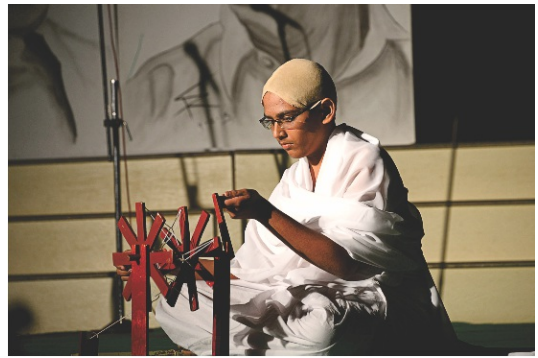
Live as if you were to die tomorrow. Learn as if you were to live forever."-Mahatma Gandhi