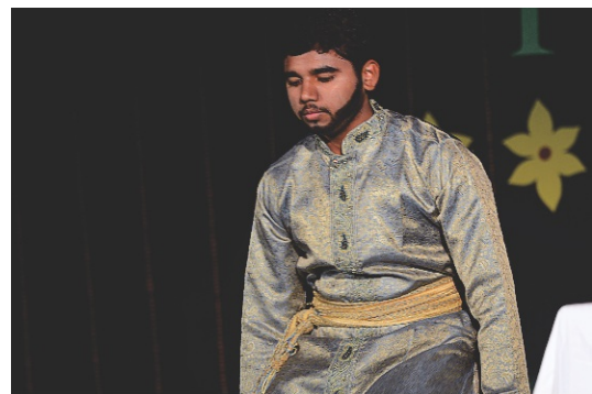
A prayer to save Tipu