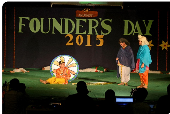
Assembly injects the Anubhuti with a dose of enthusiasm coupled with energy