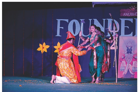
Jai Bhavani Jai Shivaji