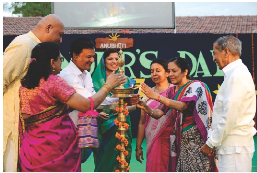
Our relationship with light is as old as our beginnings