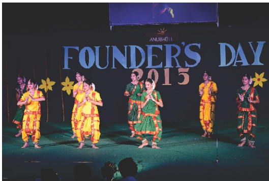
Dance from the South left us spellbound