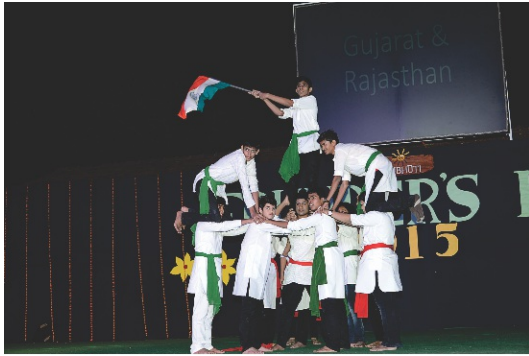
The power of youth