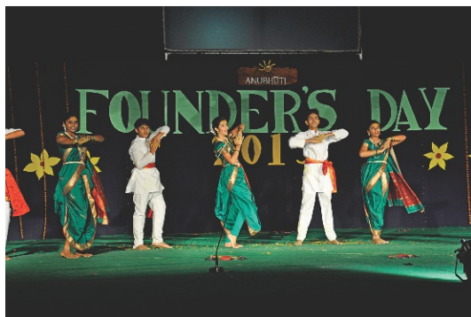
The heartthrob dance of all Maharashtrian people