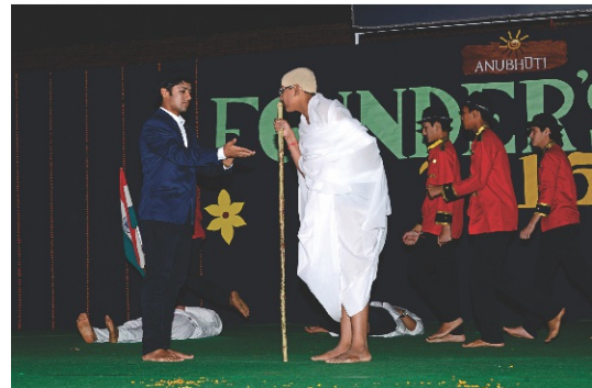
Mohandas K. Gandhi is a worldwide icon of non-violent political resistance