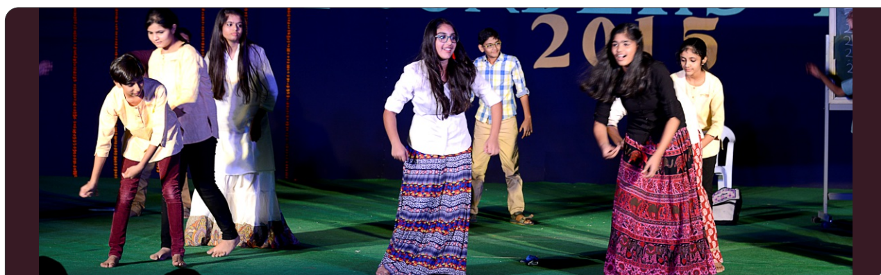
Learning is fun